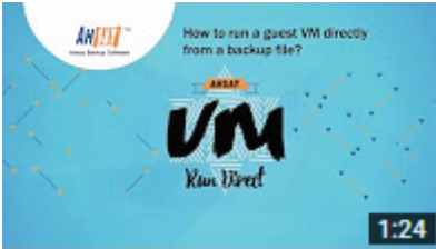
How to run a VM (VMware ESXi) immediately from backup file