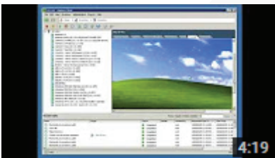
How to run and migrate VM directly from backup with AhsayOBM v7