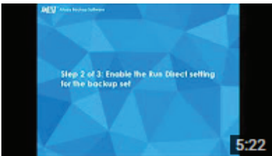
How to create VM Run Direct backup set with AhsayOBM v7